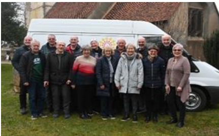
Our team of volunteers.

Furniture Friends is run entirely by volunteers. Our running expenses are about £3,500 a year. This pays for the van and our designated mobile phone and some essential items that we have to buy.