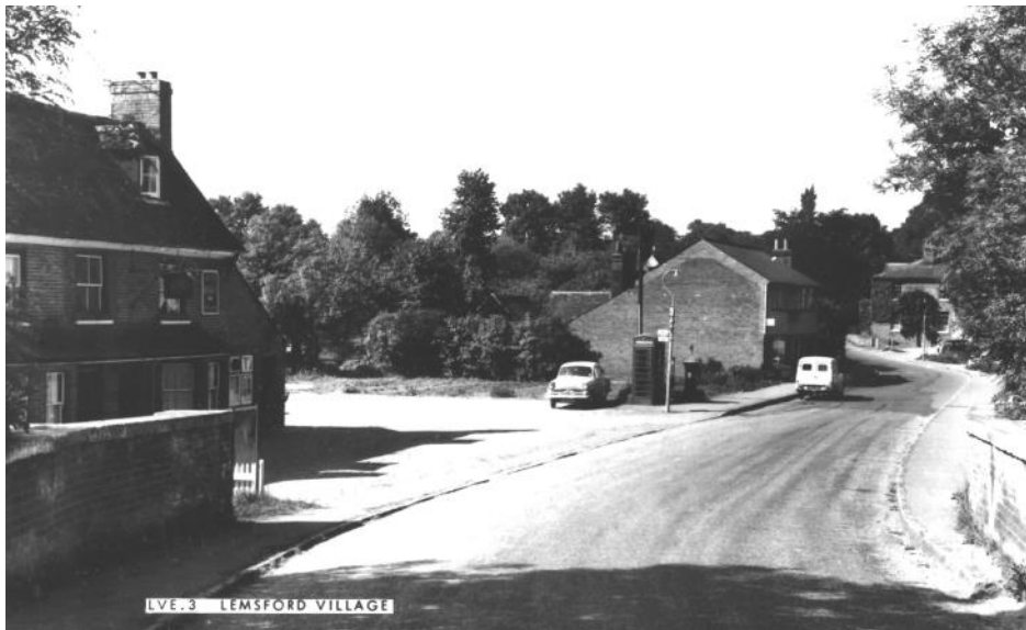
35 Lemsford Village According to David Sutcliffe

The whole of number 33 is solid brick built using externally the excellent Luton grey facings which are no longer available. Thus, the whole ground floor of the later built number 33 comprises just 2 rooms and the passageway, probably late Victorian. The first floor was contained within a roof that linked through with number 35. The village shop was created from the smithy at some time and in the late 20s or early 30s the roof was raised about 12 inches as is clearly seen in the gable brickwork and was created into a first-floor cafe with a new staircase up from the shop at the gable end. Formerly, the only access to the yard area behind the 2 properties was an 8ft passageway from the front main road created when number 33 was built, where horses entered the blacksmiths.